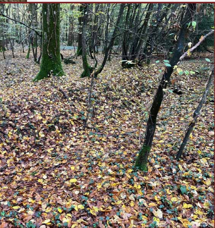
Typical bank in a Wealden Ancient Woodland. Almost certainly the boundary of a Pannage or wood-lot.

By the 16th century, the dens of Woodchurch, Tenterden, Benenden, Sandhurst, Oxney and Rolvenden had seen no pigs sent for pannage over many years. The 14th century onwards had witnessed a steady decline in the number of herds using the forest, thereby bringing